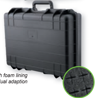
GKK 5240 with foam lining for individual adaption