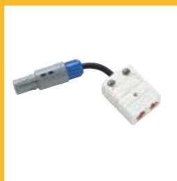
Universal Thermocouple Adapter