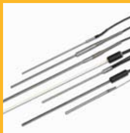
Calibrated Temperature Sensors

A wide array of accessories is available to help you maximize productivity, but the following are essential for most users.