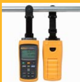
TPAK Magnetic Hanger